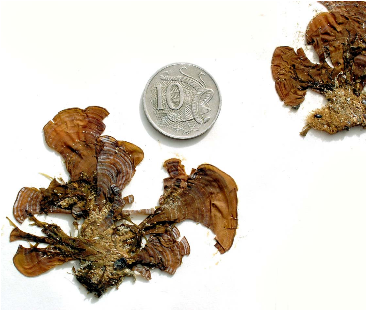
Padina fraseri (Greville) Greville (A31758), from lower intertidal pools, Apollo Bay, Victoria