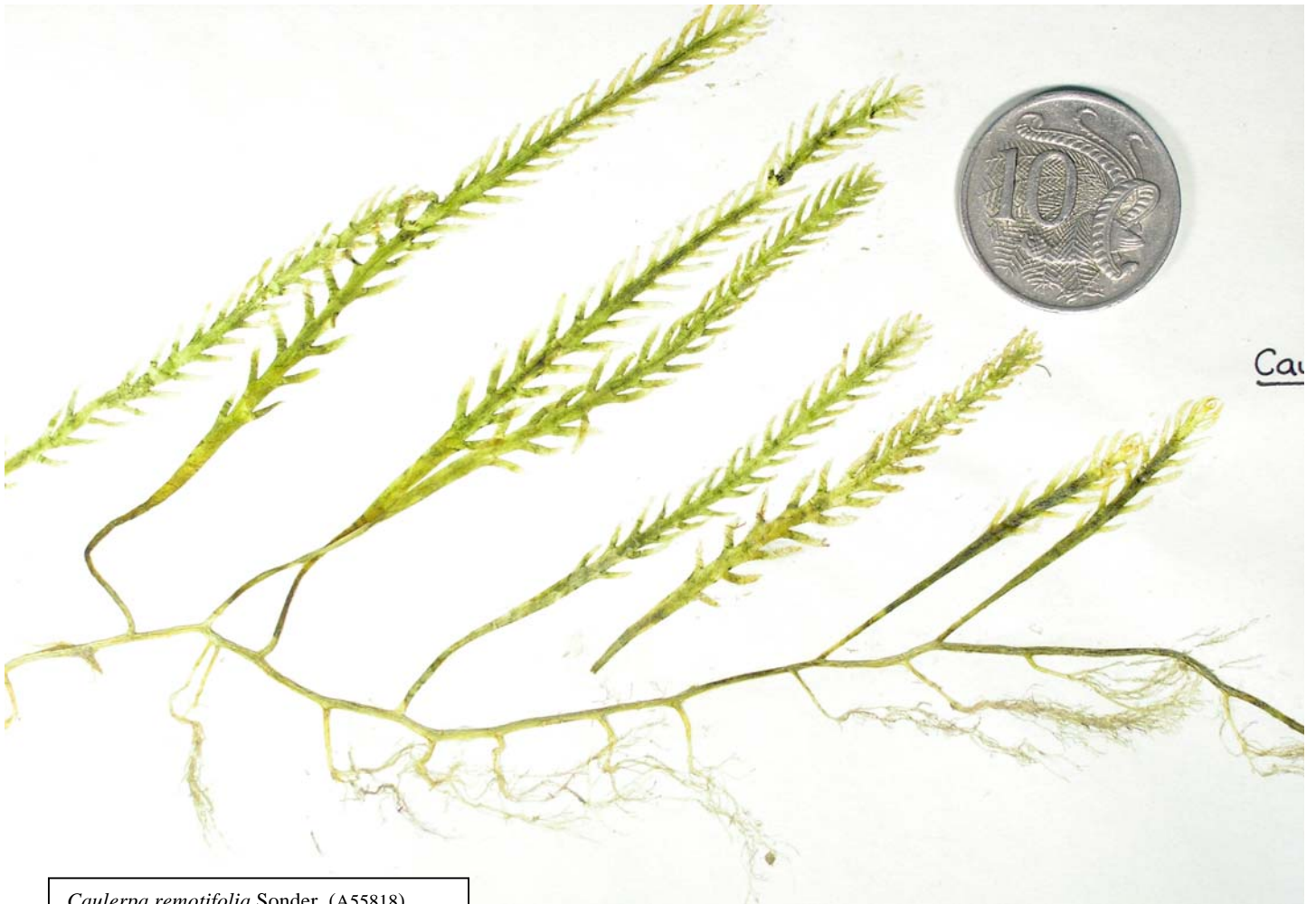
Caulerpa remotifolia Sonder, (A55818), Pelican Lagoon, Kangaroo I., S. Australia