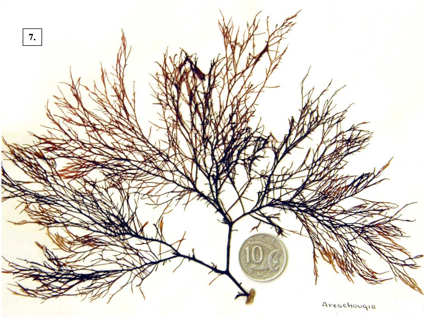
7, 8. Areschougia congesta (Turner) J Agardh, (A33305) from Grange, S Australia, on rock, 18m deep 9. a preserved, bleached specimen of Areschougia congesta , A35026 enlarged to show the irregular radial branching pattern and cylindrical branches not apparent in pressed specimens, narrow at the base .